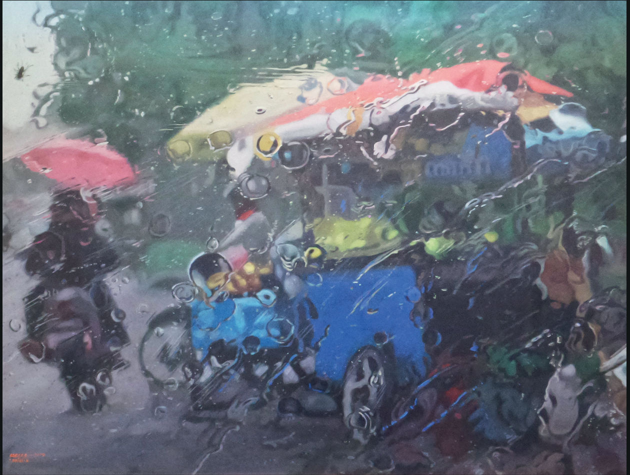
IN THE RAIN (2) acrylic on canvas, 92 x 122 cm