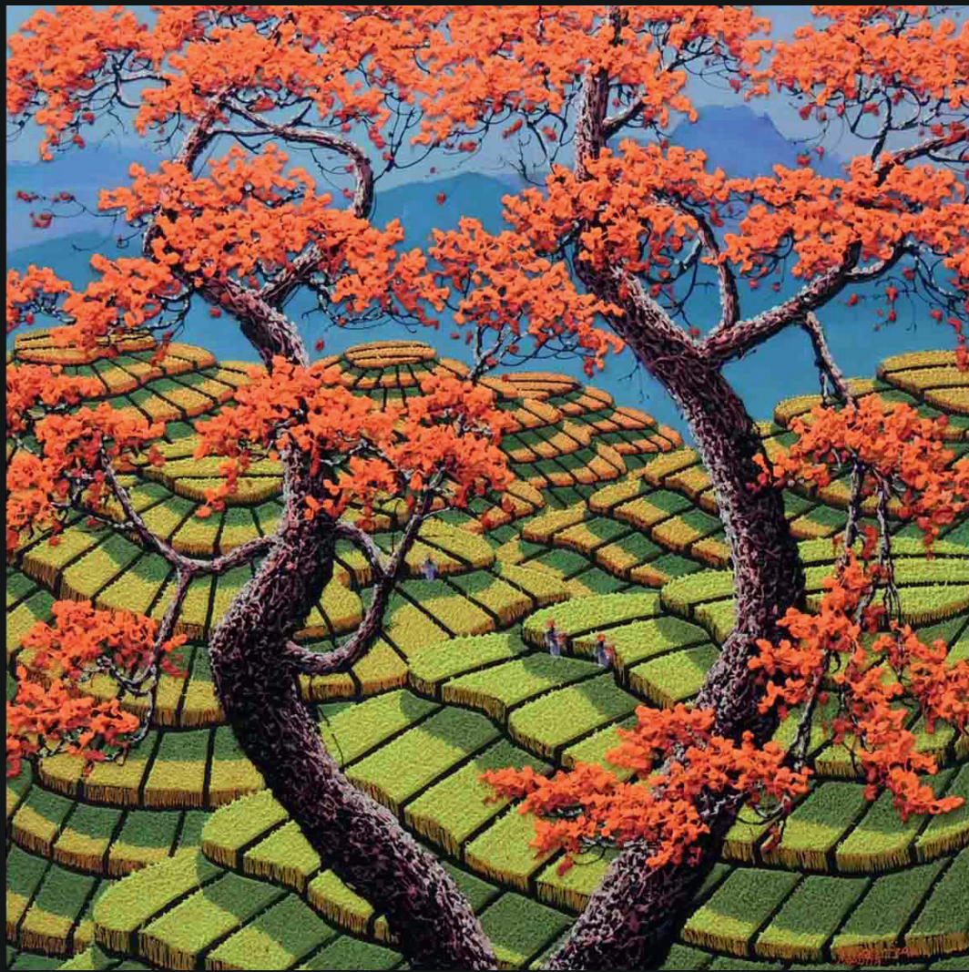
GOLDEN STEP AND RUBY FLOWER acrylic on canvas, 122x122 cm