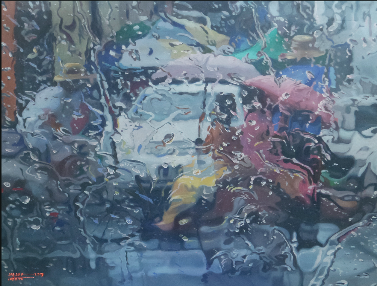
IN THE RAIN (3) acrylic on canvas, 92 x 122 cm