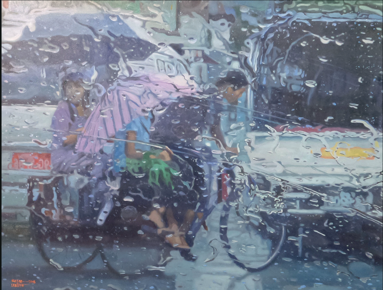
IN THE RAIN (1) acrylic on canvas, 92 x 122 cm