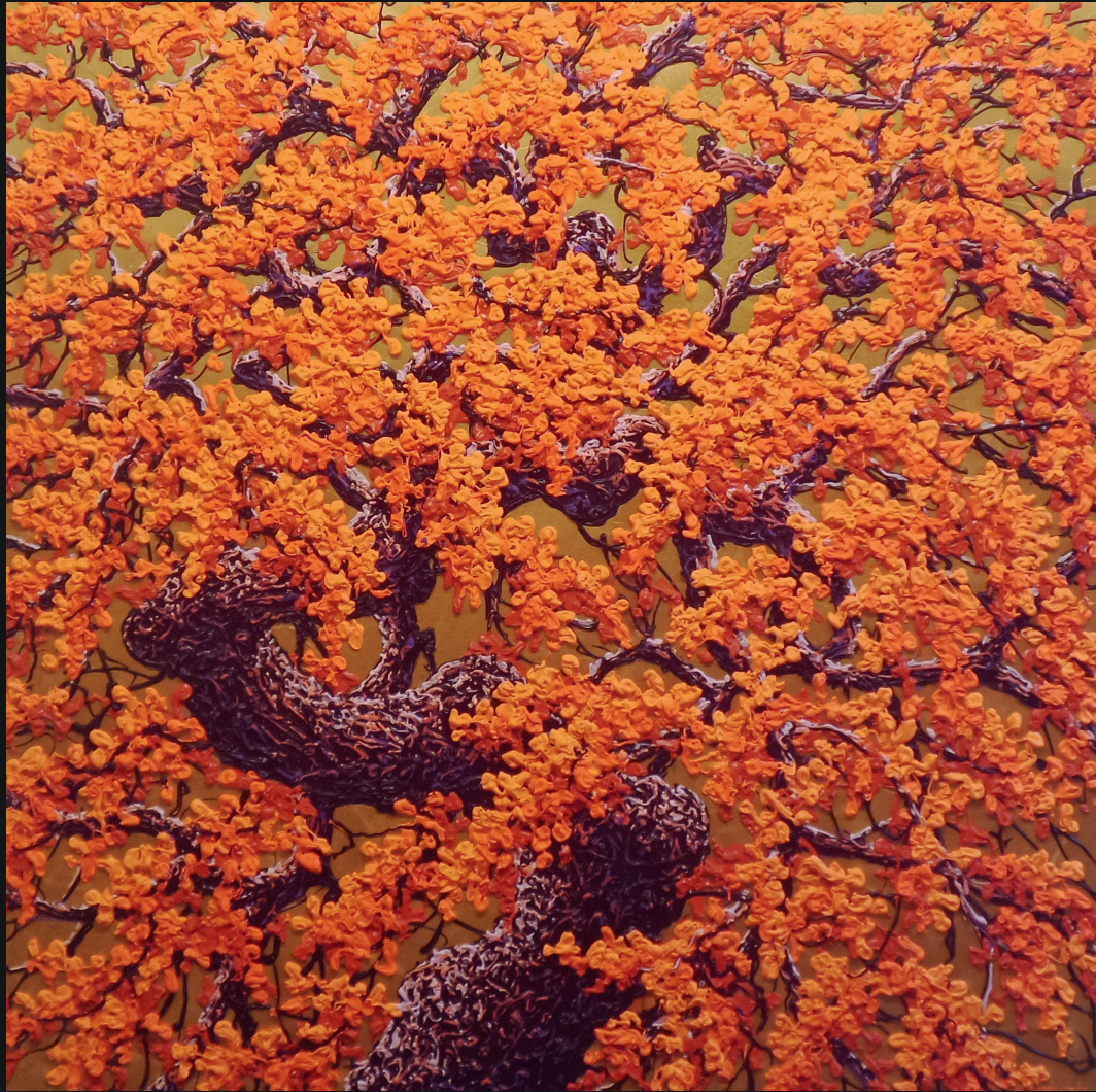
RED RUBY FLOWER acrylic on canvas, 122 x 122 cm