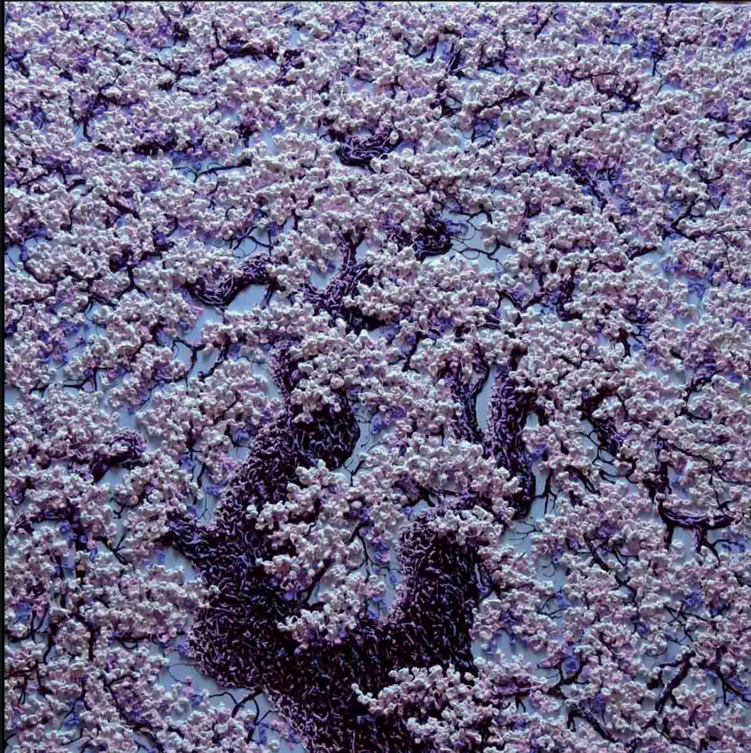
CHERRY BLOSSOM acrylic on canvas, 140x140 cm