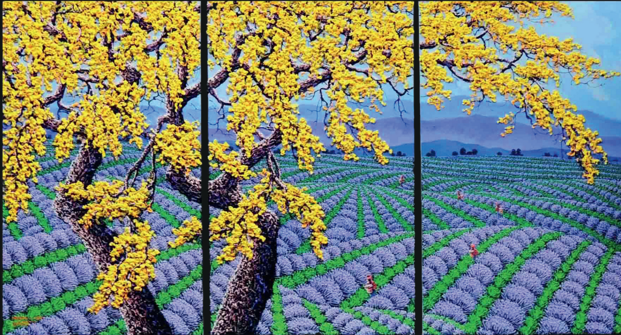
LAVENDER & YELLOW TREE acrylic on canvas, 100x200 cm