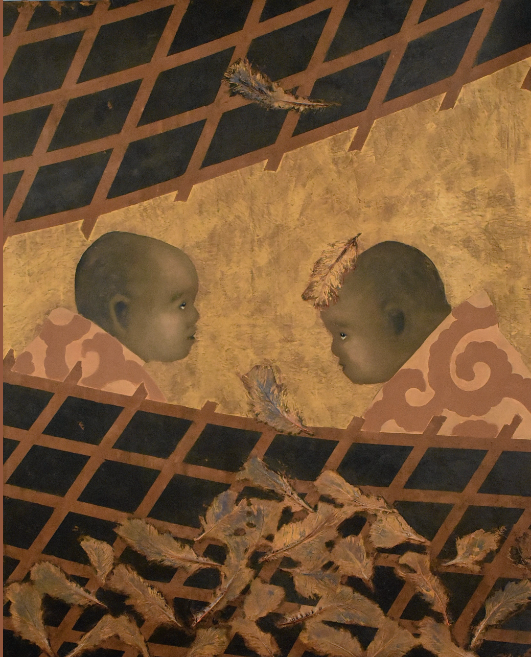
LA RÉCOLTE acrylic on canvas, 100x81cm