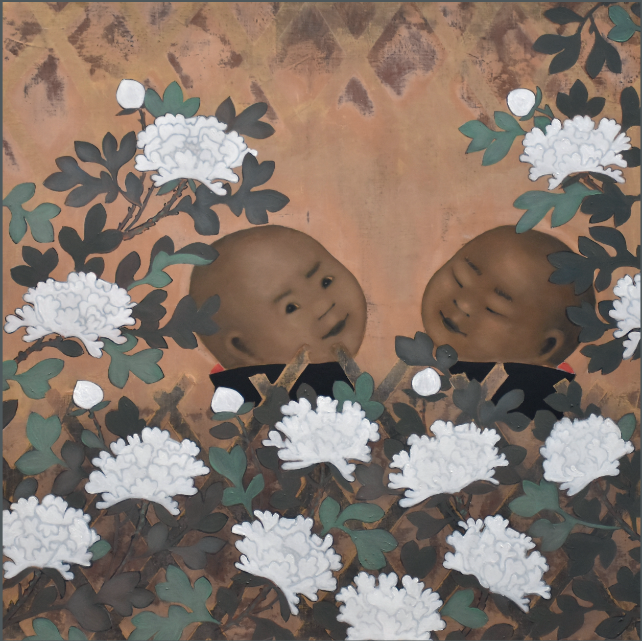
ACCORD PARFAIT acrylic on canvas, 80 x 80 cm