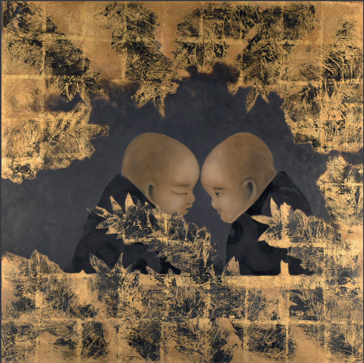
LE SECRET DÉVOILÉ acrylic on canvas, 80x80 cm