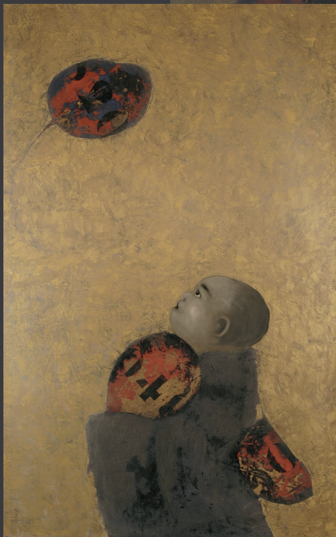
VENT D'EST acrylic on canvas, 116 x 74 cm