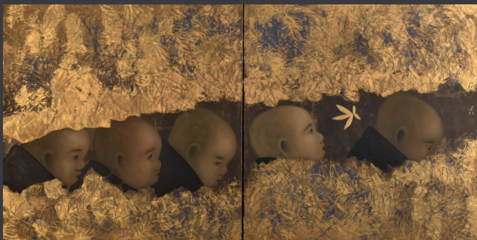
LA FEUILLE BAVARDE acrylic on canvas, 120x60 cm