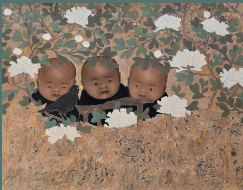
CE QUE DIT L'OISEAU acrylic on canvas, 116x89 cm