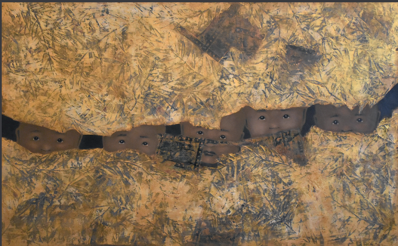
TOUS AUX ABRIS acrylic on canvas, 116x74 cm