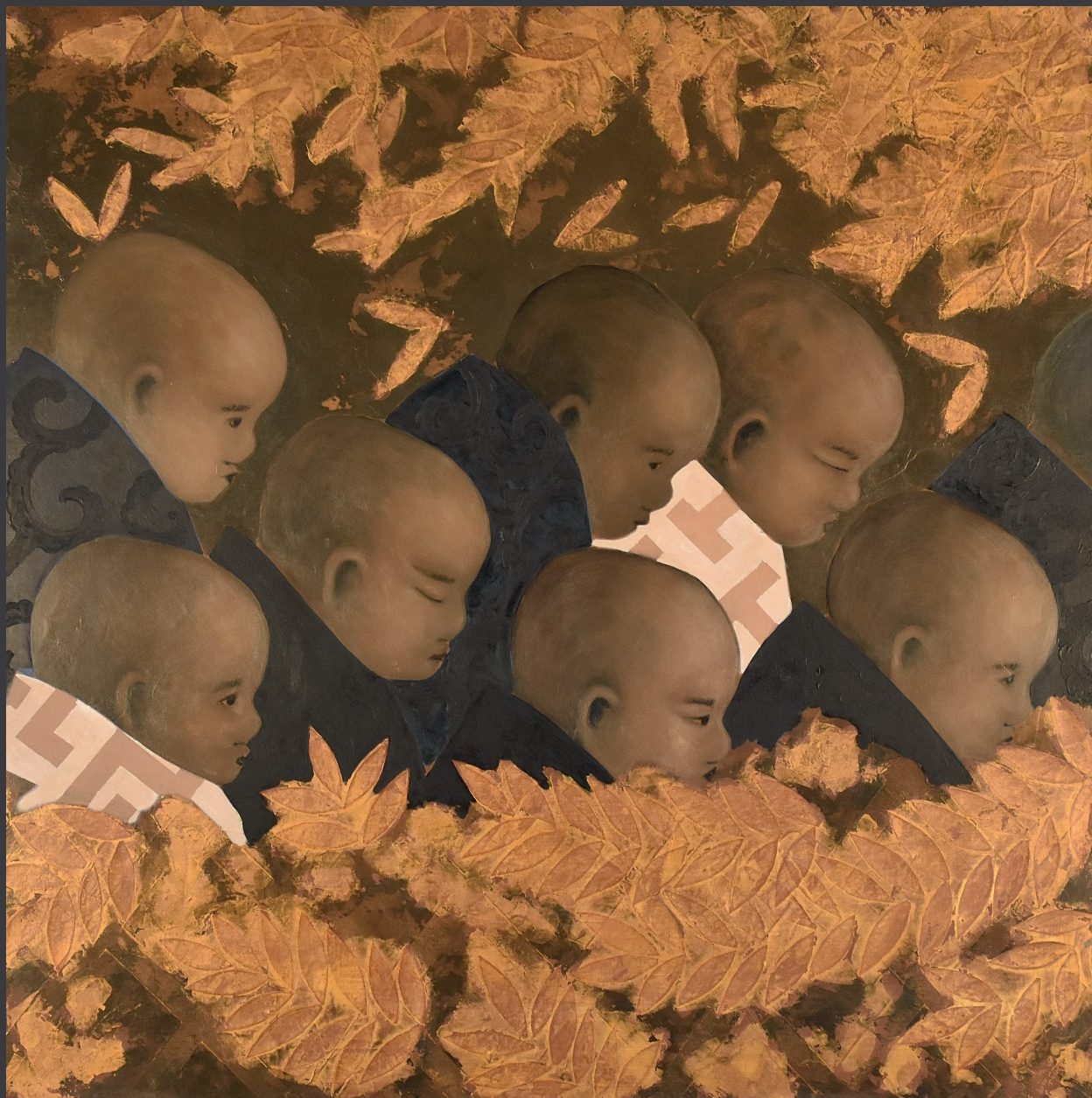
DANS LE VENT acrylic on canvas, 80x80 cm