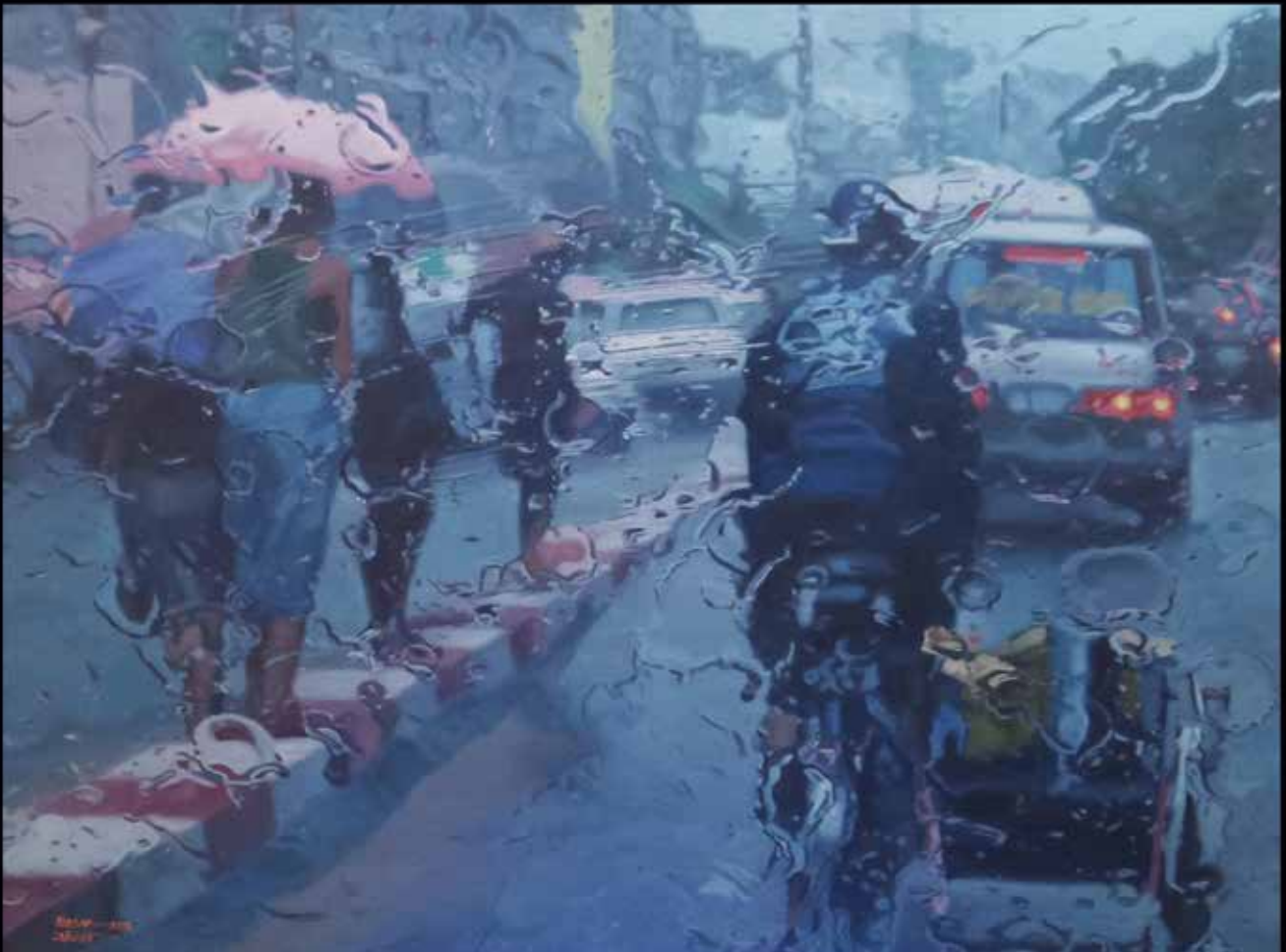
In the Rain, 2018, 92cm x 122cm